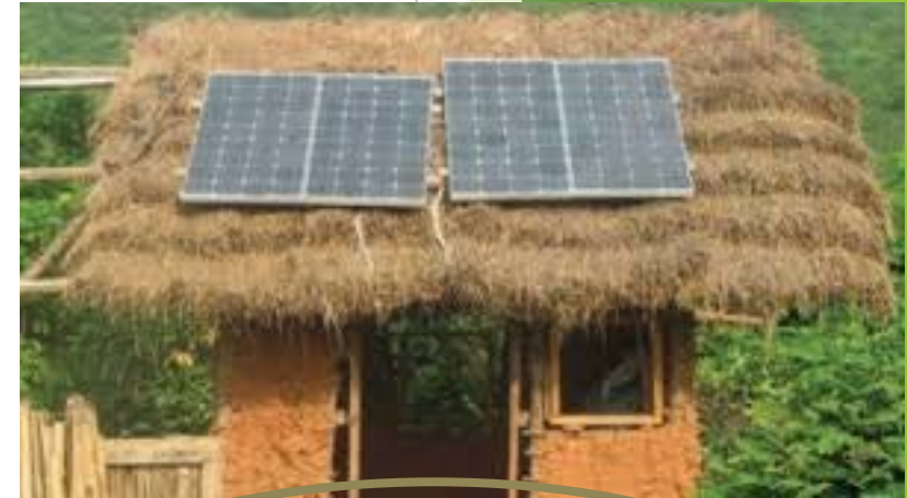
Off-grid solar (Solar Lantern and Solar Home System-SHS)